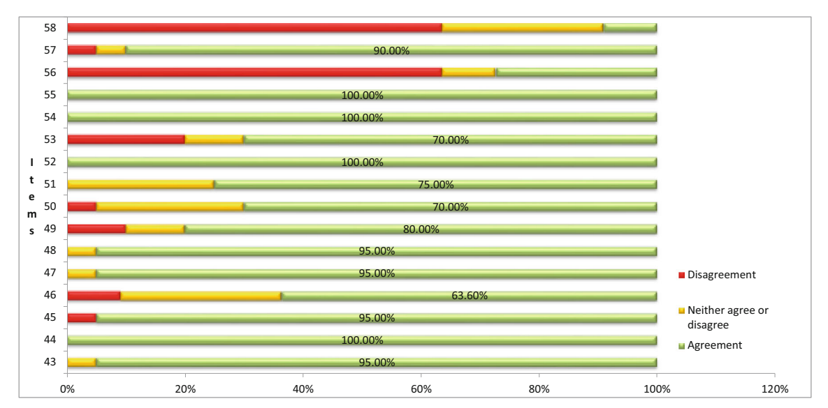
Fig. 4 Results of the fourth block of questions at the end of study

Our experts agreed that it is necessary to involve both gynecologists and primary care physicians in reproductive health, and guidelines for primary care physicians are needed to manage women at risk of low ovarian reserve. The National Public Health Action Plan for the Detection, Prevention, and Management of Infertility in the USA [14] has called for a greater integration of infertility services into the primary healthcare setting to help access screening, testing, and counseling. Additionally, respondents agreed that healthcare providers should be informed on the usefulness of oocyte vitrification and the need to assess ovarian reserve through tailored information campaigns. With regard to the process itself, there was consensus around assessing ovarian reserve by counting antral follicles in all routine gynecological visits,