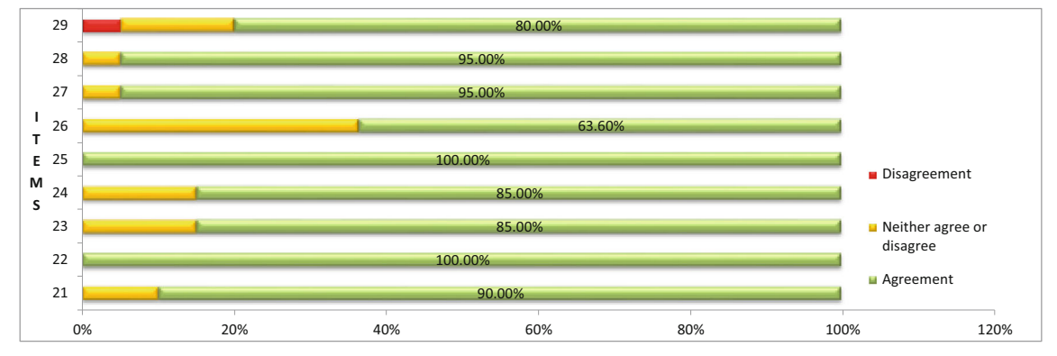
Fig. 2 Results of the second block of questions at the end of study

This consensus study reflects the views of assisted reproduction specialists and identifies barriers and recommendations for improving primary management of the reproductive health. The main barrier identified was lack of knowledge about the risk factors and prevention measures for infertility. The recommendations generating the most